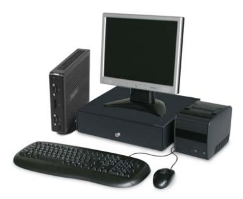
Point of sales with Shuttle XS 3600BA