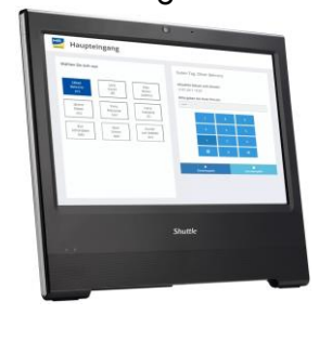
Data Collector e.g. Recording of working hours