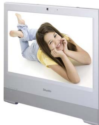
Education In schools, at home, for children and adults