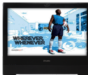
Digital Signage Visual advertising, entertainment, displaying information in public areas