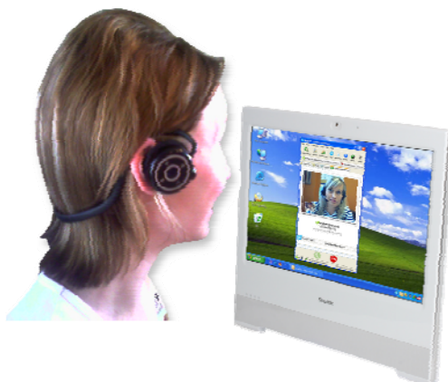
Communication Email, VoIP, Messenger, Blog, Video Conferencing