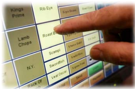
P.O.S. Point of sales