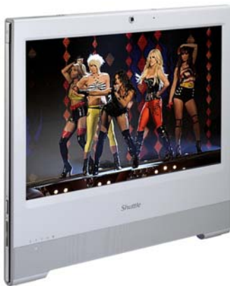
Entertainment Music, Movies, Photo gallery, TV* *) TV tuner USB stick required