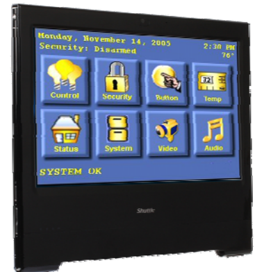
Control Surveillance, Home Automation, Control device