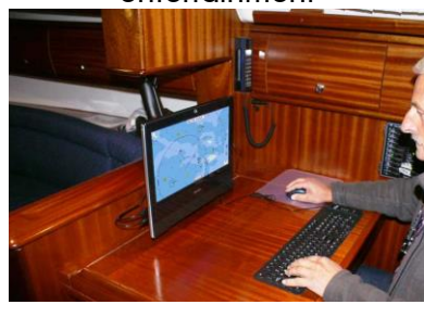
On a boat e.g. for navigation and entertainment