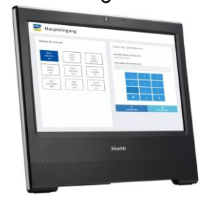
Data Collector e.g. Recording of working hours