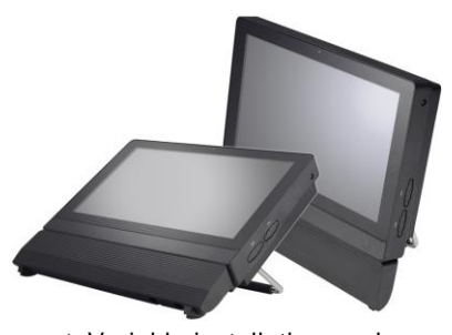
⇒ Variable installation angle