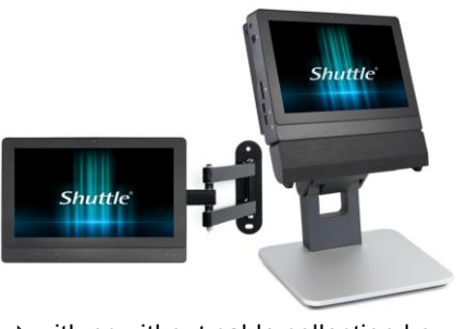
⇒ with or without cable collection box