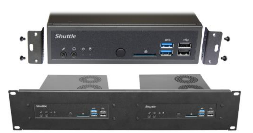
2U rack mount front plate for two Shuttle XPC slim (PRM01)