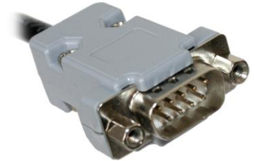
9-pin D-Sub connector