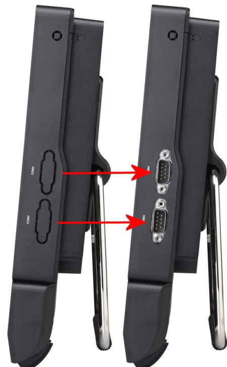
Shuttle XPC all-in-one P20U before and after the installation of PCP21