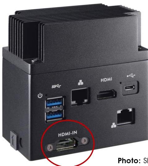
Photo: Shuttle Edge EN01 with built-in Accessory MCAP01.